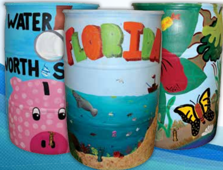
These rain barrels were painted by local high school students as part of OUC's Water Color Project.

For more ways to save water, visit conservefloridawater.org .